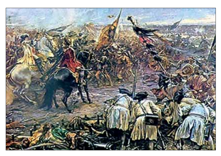
Figure 1. Battle near Senta, 1697 by Eisenhut Ferencz

years of Turkish oppression. Sombor was freed on September 12, 1687. In that war, Austria dominated until 1690, when, as a consequence of plague, there was a significant overturn. Because of the fear of the Turks, the great migration of Serbs led by patriarch Arsenije Čarnojević occurred, and larger settlements of Serbs in Vojvodina and Slavonia were founded. In the same year, Bunjevci arrived in Sombor. Later, people of Sombor participated in the famous Battle of Senta, and prevented the breakthrough of the Turks in Sombor. Hygienic conditions in the city and across the entire Bačka were catastrophic (Figure 1).