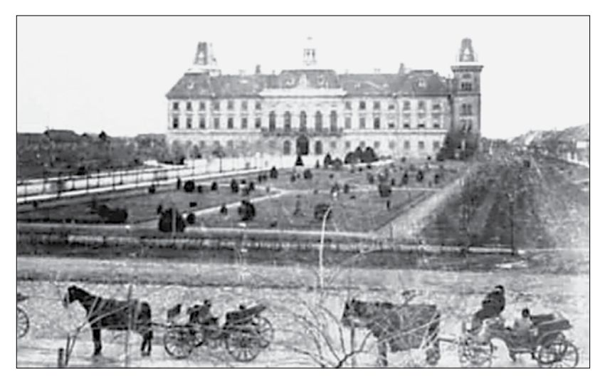
Figure 5. The area in front of the county government building during the landscape works

In 1887, Sombor got Dr. Chikash Bene for mayor. He changed the appearance of Sombor, and gave the town the looks it has today. The effluents of the Mostonga river were finally brought into order, the streets were better paved, the horse omnibus from the railway station to the hotel and the buses to neighboring towns were introduced. The most important of all was the beginning of planting of hackberries in the streets and squares, making the area greener in the form of numerous parks (Figure 5). He was not a doctor, but he left traces in Sombor health. He formed the county treasury for social security and before the World War I he founded the anti-tuberculosis dispensary. Dr. Chikash Bene, was a lawyer born in Doroslovo (a village near Sombor) in 1853. He left an indelible mark in the appearance and pride of Sombor, which received one more name, the "Zelengrad" (green town).